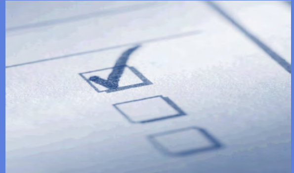
Overall practice scores